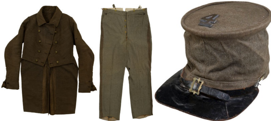
This militia uniform, worn by Captain Peyton Hale of the 4 th Virginia includes a forage cap with leather visor and grey pants with a brown 1" trim sewn into the trousers. 14